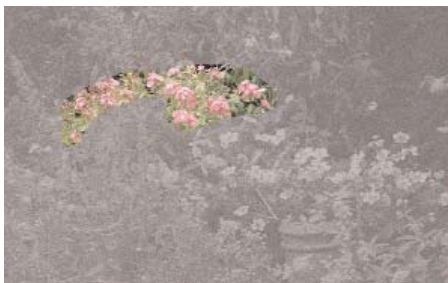
Figs 12, 13 & 14

Filter > Noise > Add noise will bring up a control box , and you can create a 'fuzziness' in the background of your picture. A combination of a little of both these effects is usually effective.