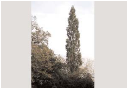
Figs 9, 10 & 11