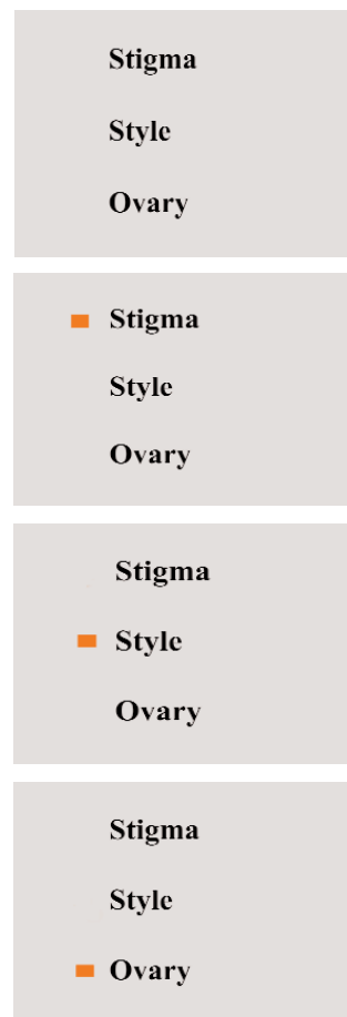
figs 5, 6, 7 & 8

In Photoshop , a simple way is to use the pen tool to draw a line around a designated plant. However a far more sophisticated method is to select the critical part of the picture, then to blur or change the colour, or perhaps de-saturate (change to black and white) the rest of the image. This means that the important selected part is in effect highlighted compared to the rest of the picture. (More on this in some detail in Appendix H.)